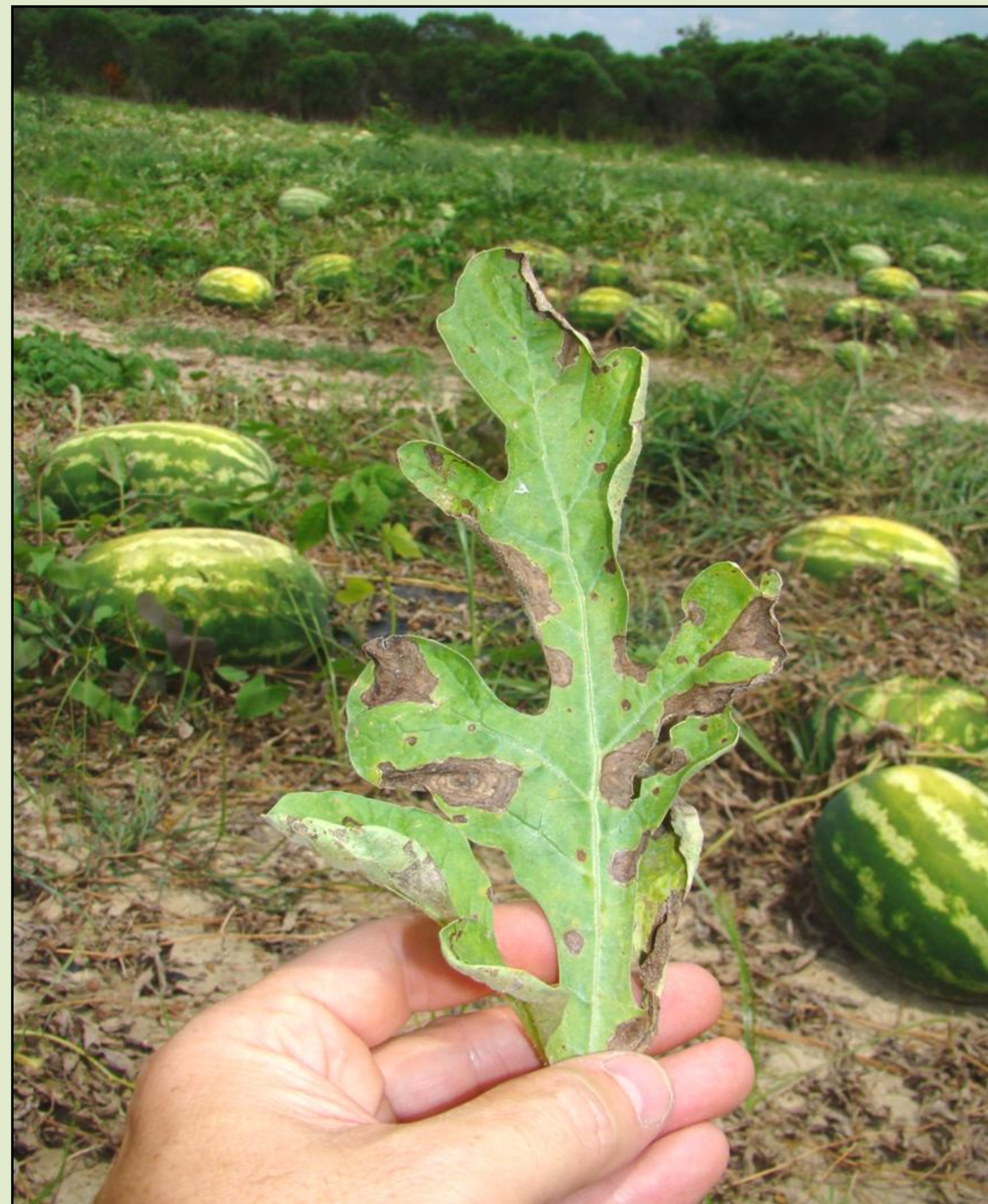
Figure 1. Gummy Stem Blight on Watermelon

Georgia's subtropical climate creates ideal conditions for plant disease development, especially gummy stem blight (GSB). GSB, Didymella bryoniae (fig 1) is the most destructive disease in Georgia watermelon production. Growers have several fungicide options, available but many have had resistance develop to them by the GSB fungus. There are substantial cost differences among these fungicides as well. Economical fungicide efficacy needs to be evaluated for controlling GSB in Georgia to optimize disease suppression while maintaining disease control.